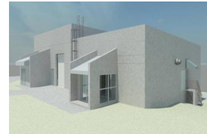
Rendering of LLWT Treatment Facility