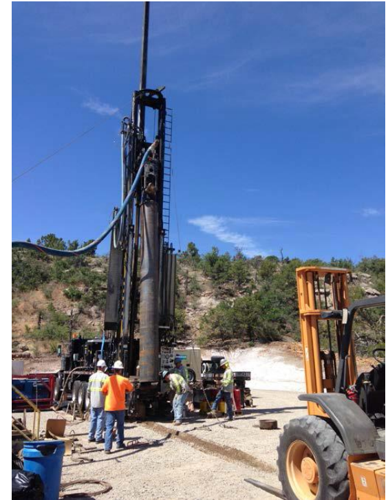
Drilling to install the CrEX-1 extraction well began on July 4.